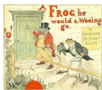
Activity Books - Print and Play

See below or click on Books to see different categories. All the books are free to use and some of the books are also available for download.