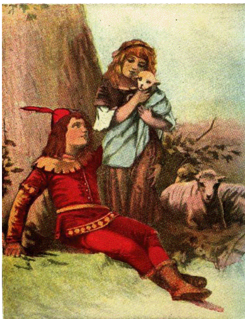
Prince Florizel and Perdita

The wedding was a merry one, in the mossy glades of the forest. A shepherd and shepherdess who had been friends with Rosalind, when she was herself disguised as a shepherd, were married on the same day, and all with such pretty feastings and merrymakings as could be nowhere within four walls, but only in the beautiful green wood.