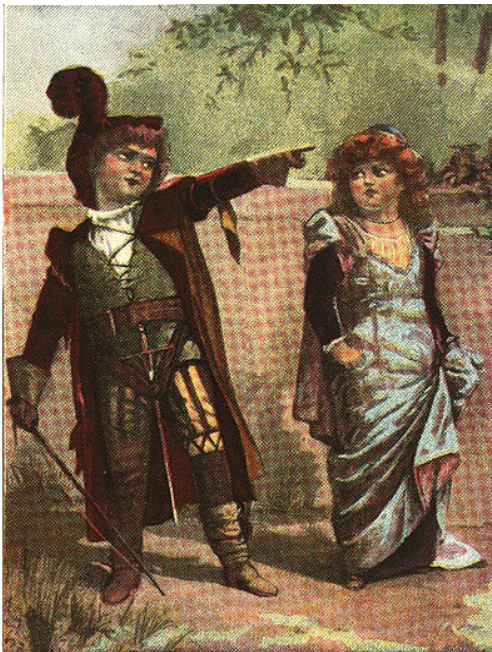
Petruchio and Katherine

With his own hand he stabbed himself to the heart; and ere he died his lips touched the face of Desdemona with despairing love.