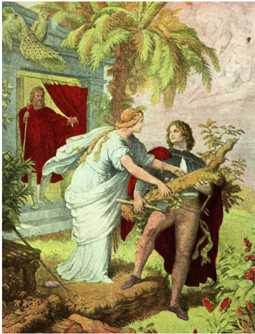
Ferdinand and Miranda