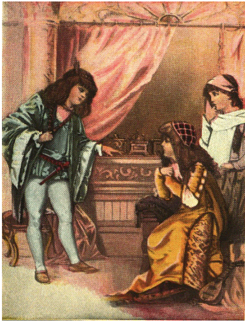
Choosing the Casket